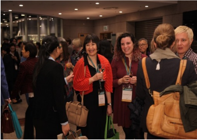
Delegates during the event