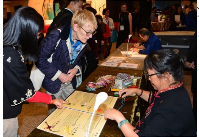
IIC-Palace Museum 2017 Hong Kong Symposium/LCSD

offered a gift of their names written in Chinese in rainbow ink and auspicious Chinese knots to bring them luck. Furthermore, delegates were invited to visit the behind-the-scenes tour of a Silk Road exhibition, in which over 200 sets of treasures selected from the Routes Network of the Chang'an-Tianshan Corridor were exhibited. Five cultural tours and a textile workshop were brought to some of the lucky delegates (who were fast enough to sign up for the programmes) as a finale of the Symposium before all departed Hong Kong with smiling faces, refreshed minds and new connections for opportunities. To recapture the fond memories of the Symposium, we will put together the event photos for all to share on the symposium's website.